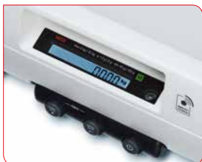
The new backlit LCD display ensures an easy reading of the digits, even in dimmed rooms.