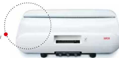
Thanks to the additional measuring tape, the seca 757 enables a precise measurement of the babies' length.

With the seca 360° wireless technology, the seca 757 can transmit measurements to the optional seca 360° wireless digital printer. With the network-capable software solutions seca analytics 115 or seca emr flash 101 and wireless USB adapter seca 456, your PC can receive and analyze measurements and forward them to an Electronic Medical Record (EMR) system. The seca 757 is EMR integrated, ready to handle digital patient records and all the demands the future will bring. For more information about EMR integration, visit: www.seca.com .