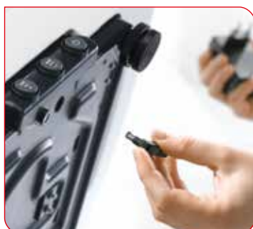
Can be operated by battery or power adapter.