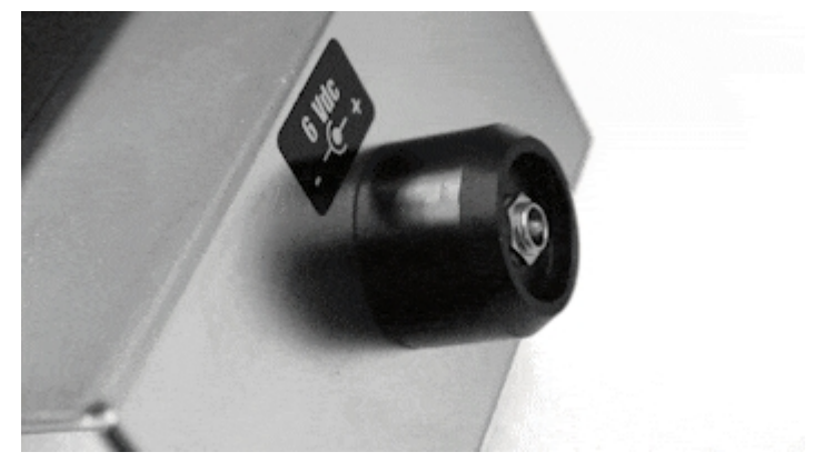
Battery with INSTAPLUG innovative quick coupling wireless system.